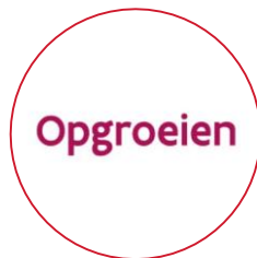
Regional Agencies in charge of youth care